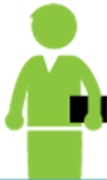
Community Health Worker

As part of the work conducted for the Oklahoma Community Health Worker Coalition